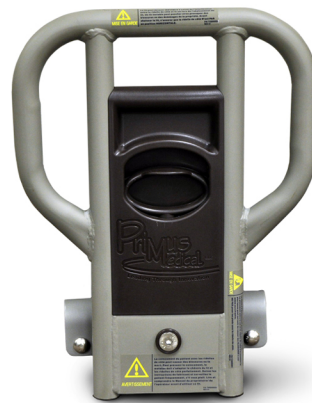
Rotating Assist Bar SP01-PCB901ARE

The PC Transporter allows ease of mobility when relocating a bed within a facility or home setting. The PC transporter installation can be completed by one person in around 5-10 minutes and can also be moved by one person as well. Transporter is shown below in rolling position