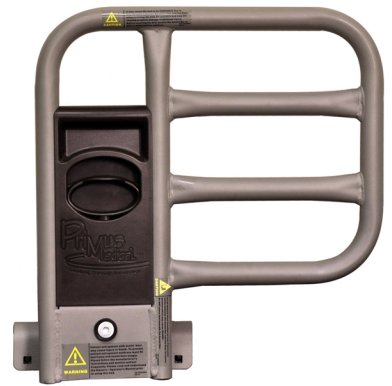
Rotating Assist Rail SP01-PCB901ARE2